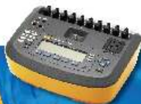
ES5820 Electrical Safety Analyzer

Designed by you. Engineered by Fluke Biomedical.