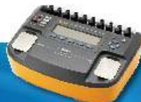
Impulse 1000DF Dielectric/ Transmittance Parameter Analyzer