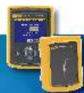
TNT 12000 X-Ray Test Device

©2008 Fluke Biomedical. 6/2008 3354630 T-EN Rev A